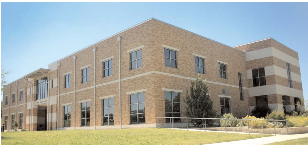
Temple College NEB Administrative Building

Temple College retained the services of Johnson Controls Inc. of Milwaukee, an energy services company, or ESCO, who determined that numerous large glass windows were contributing substantially to the campus' overall energy inefficiency. Johnson Controls determined that LLumar energy-control window films, which would significantly reduce summer solar heat gain and winter heat loss through these windows, should be an important part of an effective energy-saving strategy for the college.